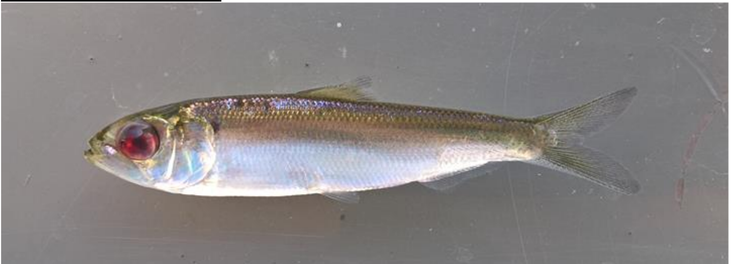
Juvenile American shad ( Alosa sapidissima ), approximately 70mm fork length with eye hemorrhage, sampled at Bonneville Smolt Monitoring Facility this week.